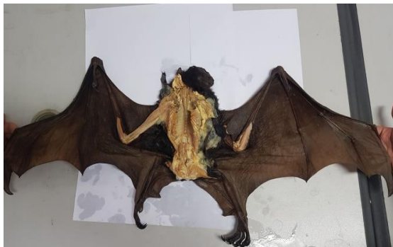
Figure 1. Morfology of Pteropus vampyrus

The humerus is shorter in size compared to the radius. Special characteristics that distinguish ulna with a radius that is of bone diameter and bone length. Ulna has a length of \frac{3}{4} of a radius, besides that the bone structure is also more elastic ( fig. 5 ). Carpal has an irregular structure ( fig. 6 ). The special feature of Pteropus vampyrus 's forearm that distinguishes it from other bats is the long thumb with the shape of a curved, dark nail. This is because its body size is larger when compared to other species of bat. This thumb serves to climb trees or move from one branch to another.