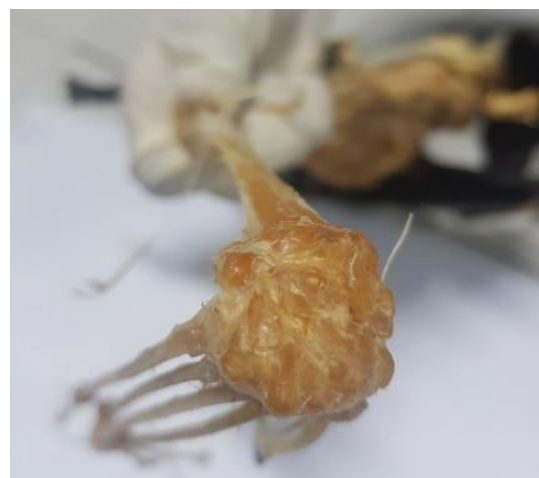
Figure 6. Metacarpal structure at Pteropus vampyrus