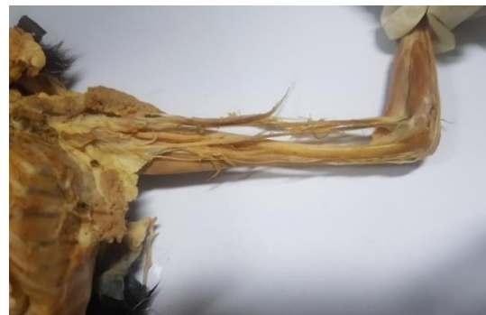
Figure 4. Humerus of Pteropus vampyrus .