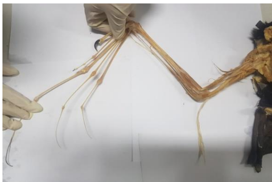
Figure 2. Forelimb Anatomy of Pteropus vampyrus