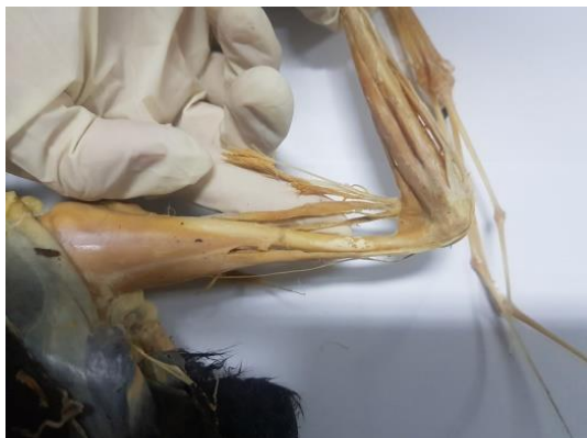
Figure 7. Anatomy structure of Pteropus vampyrus muscle and ligament

The wings of fruit bats have a well-developed but lightweight bone structure, robust muscles, and a tough patagium, or wing membrane. The rear legs are specially adapted to allow the bat to hang upside down without using any energy. Old World fruit bats utilize their thumbs, wings, and legs to climb, grab, and manipulate objects. They also use these appendages for thermoregulation, self-defense, and for supporting the weight of their young. Bats also have an unusual behavior in which they invert themselves by hanging from their thumbs to remain clean while defecating. Therefore, from an early age, the thumbs of Old World fruit bats must be strong enough to support their body weight (Seguin, et.al., 2000).