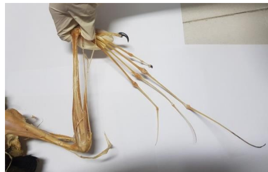
Figure 5. Radius and Ulna of Pteropus vampyrus .